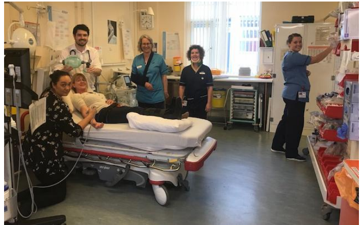
Orkney A&E Team practicing their skills

"The key is collaboration, communication & working smarter across the NoS network."