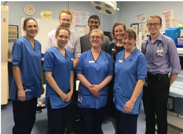
Shetland A&E Team